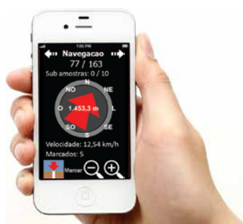
APPLICATION FOR ANDROID IOS and Windows phone platforms.