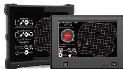
VCOM 10.0 / VCOM 7.0